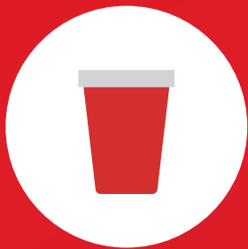
Closed Sharps Disposable Containers