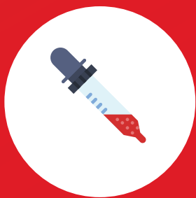
Blood Saturated Items