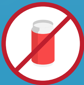
Fixatives and Preservatives