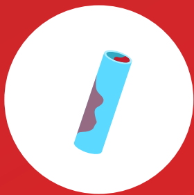
Visibly Bloody Plastic Tubing