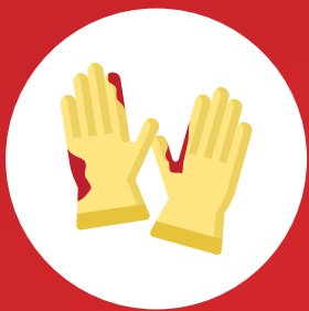
Visibly Bloody Gloves