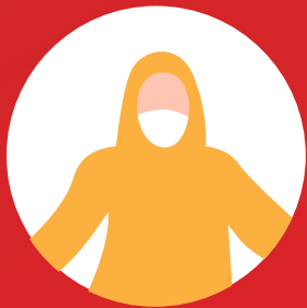
Visibly Contaminated PPE