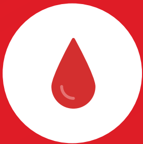
Blood & Body Fluids