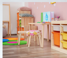
DAYCARE & SCHOOLS